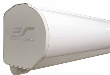
White Aluminum Housing